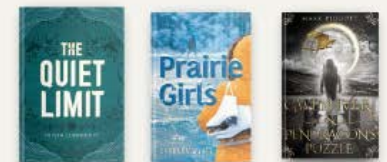
YA (Young Adult)